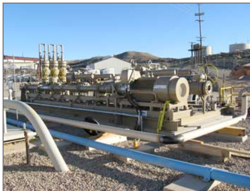
The final product is located in Aneth, UT.

... THESE MARKETS: Energy, Drilling... www.commtest.com