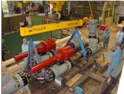
The custom-designed skid needed to contain all of the pumps, components and controls for boosting carbon dioxide to the pipeline.

The project got underway in November 2006 with the objective of fabricating a custom-designed skid that contained all of the pumps, components and controls needed to boost CO 2 in the pipeline. Due to changing elevations along the pipeline path, the booster skid was needed to help carry the product to its destination.